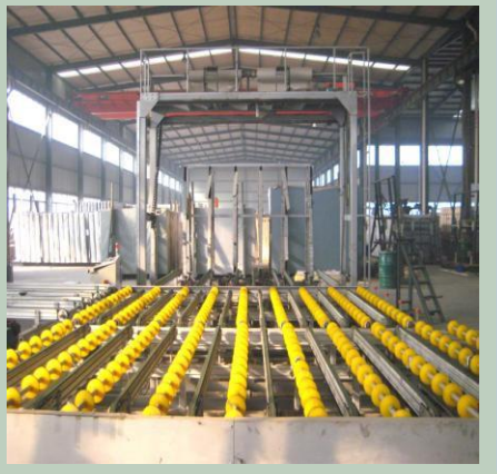
Equipment & Production